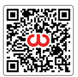
Scan to Watch Video How to: Bench Bleed a Master Cylinder