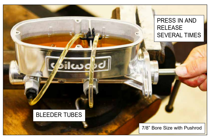
Typical Bleeder Tube Setup and Use